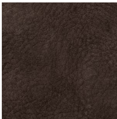
2114 testa di moro 2114 dark brown