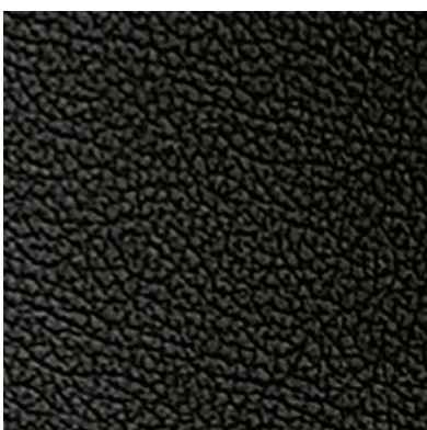
F04 nero F04 black