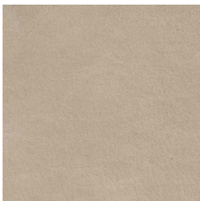
2118 perla 2118 pearl grey