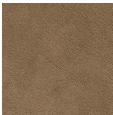
2116 castagna 2116 chestnut brown