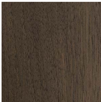
Tabacco Tobacco finish