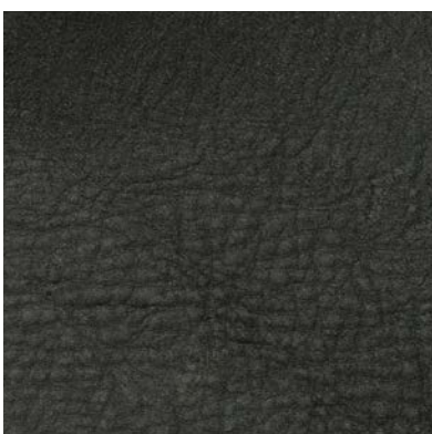
2138 lavagna 2138 slate black